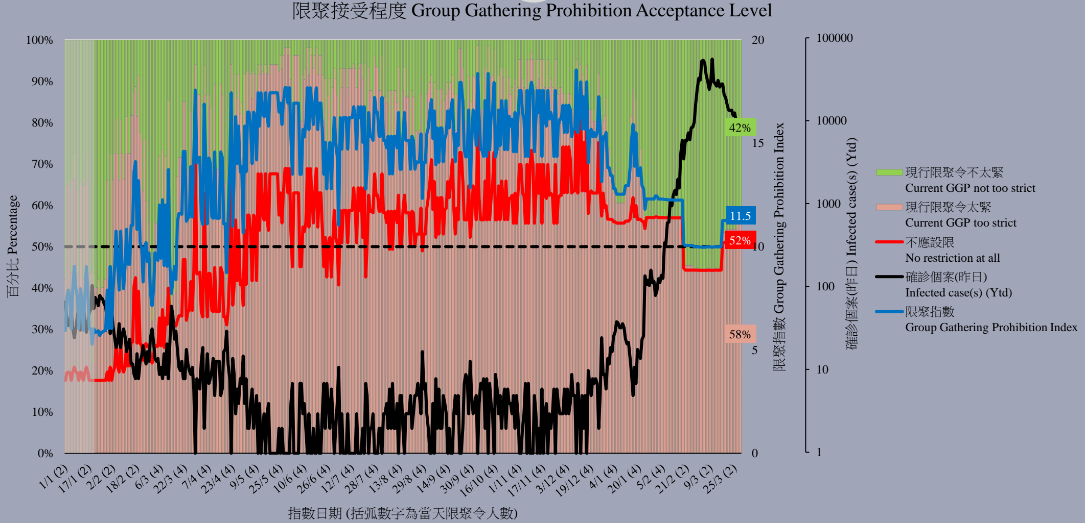
Date of PEGRI (figures in bracket = size of group gathering allowed that day)